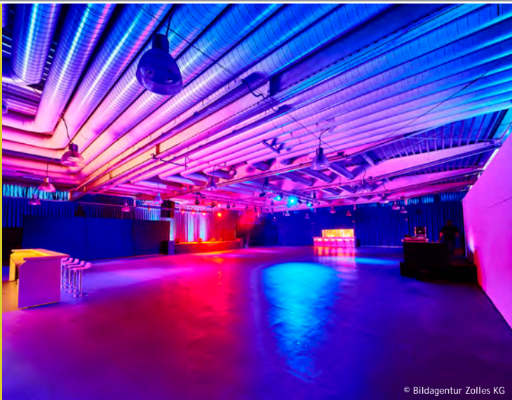
Hall E, E-Box