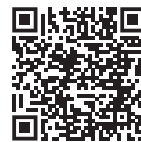
Large Gala - Seating layout