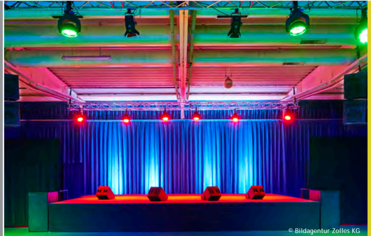
Hall E, E-Box

The E-Box club setup offers a special stage for artists from all over the world. The professional know-how of the Wiener Stadthalle makes this variant with club atmosphere even more attractive.